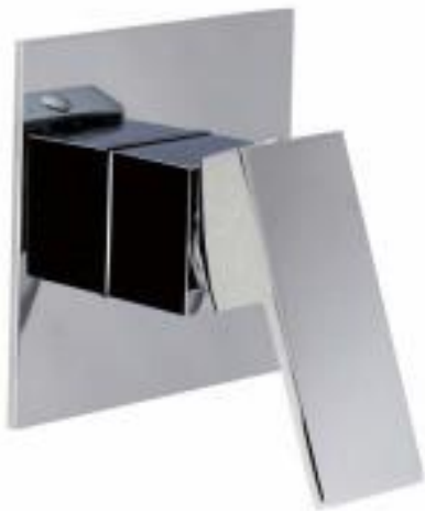
Shower Wall Mixer